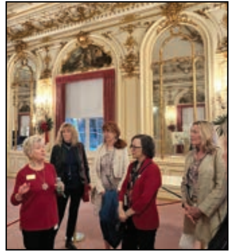
All guests enjoyed a guided tour.