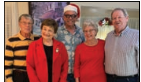
A few of the couples...