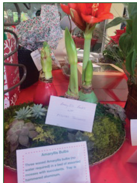
Make, Bake, and Grow auction item