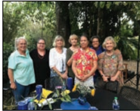
Garden Club of Ft. Pierce members are honored volunteers at Heathcote Botanical Gardens.

During this season of giving and light, a number of our members have been sharing their energy at Heathcote Botanical Gardens. They have decorated the Pioneer House, Heathcote House and the Bonsai Garden for Heathcote's fundraising