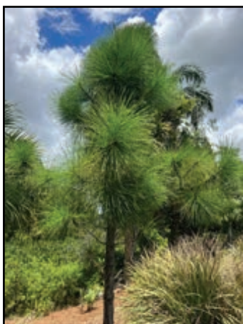
Wellington Garden Club will be planting a slash pine ( Pinus elliottii ) to celebrate Florida Arbor Day on 1/19/24.

5)In addition to a ceremonial tree planting, many of our clubs are giving away seedlings, offering guided tours, or hosting other ancillary events. Check out what your garden club has planned.