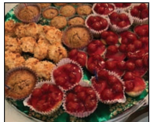
A few of the yummy desserts!